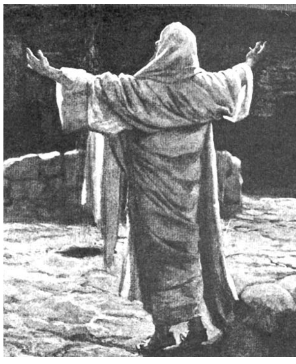
Christ going to the Mount of Olives at night, by James Tissot,

you is true for you, and what's true for me is true for me." According to moral relativism, morality is determined by what I like, want, feel, need, think, or desire at the moment. Its slogan could very well be, "If I like it. do it." Though the relativist approach to morality is the most common today, most people are inconsistent in